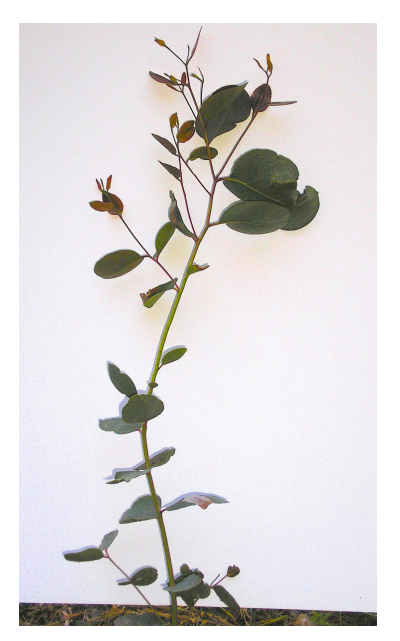
New tree plantings in Lot D

All appear to be doing well and the new spring growth is a very positive sign.